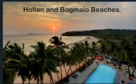
Hollan and Bogmalo Beaches.