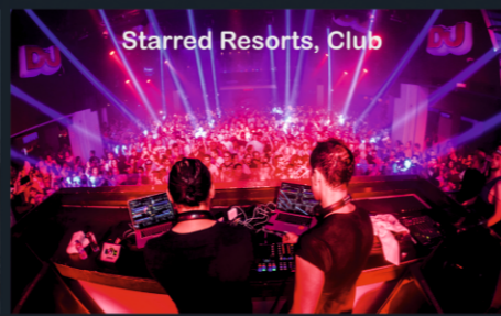
Starred Resorts, Club